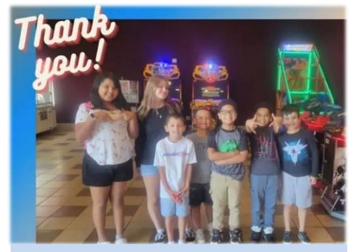
Club members enjoyed the movie "Playing with Fire" at the Regal Rancho Mirage.

Where did summer go? This issue photo-highlights some of the hot weather Club activities the kids experienced, like deep sea fishing, swimming at the Palm Desert Aquatic Center, watching a big screen movie in an actual theater, as well as a success story resulting from our scholarship program which has existed for nearly 50 years.